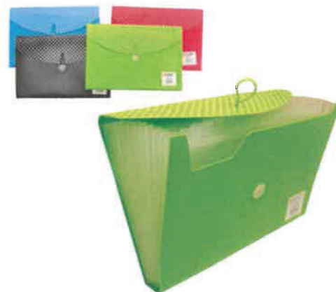
Sample: Accordion Folders

The 1 st day of school is Wednesday, August 15 th